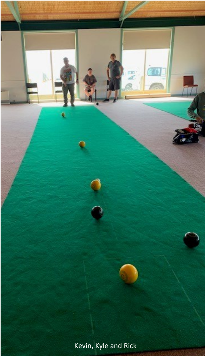
Kevin, Kyle and Rick

This term we had 4 clients along with 3 staff. The clients picked the game up well and excelled with experience. We had a fantastic term 1 and hope to see it grow over the next 12 month.