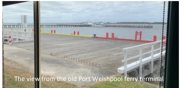
The view from the old Port Welshpool ferry terminal