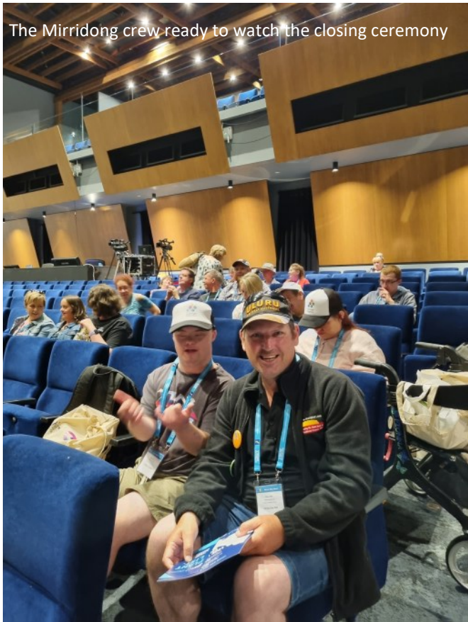
The Mirridong crew ready to watch the closing ceremony

All enjoyed walking around the displays and collecting free merchandise – they arrived for the day with one bag and left at the end of the day with up to 5 - 6 bags.