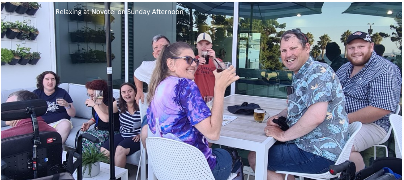
Relaxing at Novotel on Sunday Afternoon

It was a very tired group of people that arrived back at Mirridong on the Thursday afternoon.