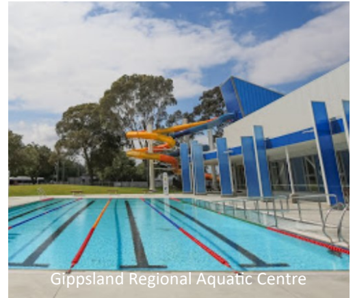
Gippsland Regional Aquatic Centre