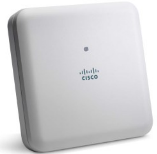
Cisco WIFI Access Point