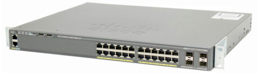
Cisco network switch

Mirridong Services is tremendously appreciative of the generous discount made by Cisco and Connecting Up to our service.